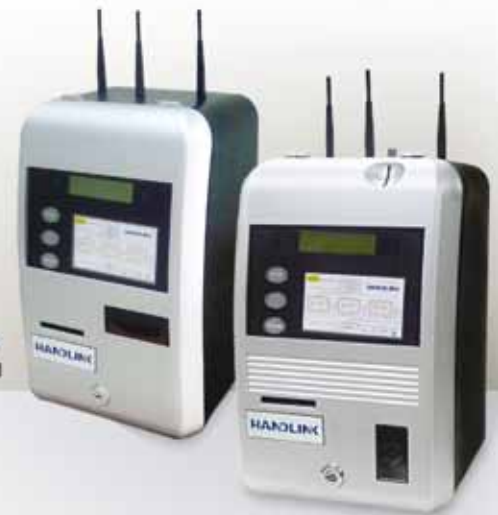
KS-861 Banknote Model

Wi-Fi Internet Solution for 24 Hours Self-Service, Food court and Youth Hostel