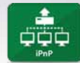
KS-852 Coin Model